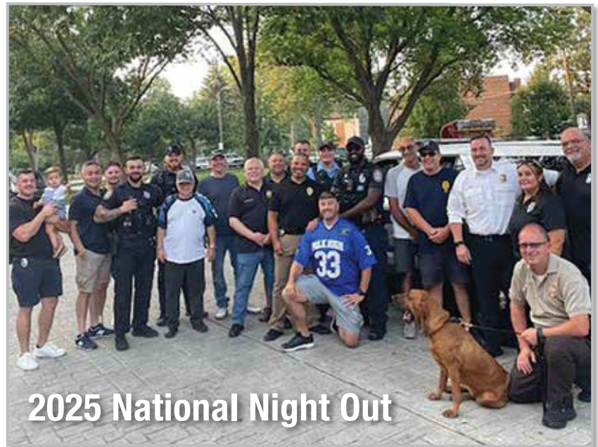
2025 National Night Out