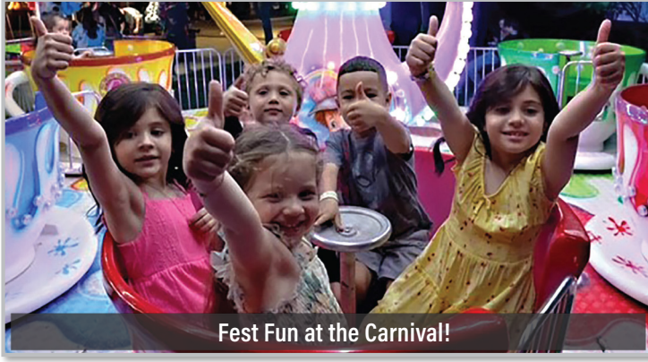
Fest Fun at the Carnival!

The 2025 River Front Fest is in the books! We lucked out with wonderful weather, a great carnival, music for everyone, and a hybrid of local restaurant booths and food trucks. Many said this year's food selection was the best ever! The Village is thrilled with how well this high-energy event turned out. There is a great deal of work that goes into planning, setting up, recruiting volunteers, and ensuring all aspects of public safety are covered. This event would never be able to go on without the cooperation of all involved, including our sponsors . We are fortunate to have committed sponsors who believe in our mission and are willing to contribute to the event. We also have to give a shout-out to our dedicated Public Works, Police, and Fire departments , who were all at the top of their game during this event. Lastly, we are so grateful to all who volunteered ; your commitment to the Fest is so greatly appreciated. It is always a positive experience when we can bring our community together for River Grove fun.